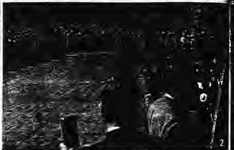
(1) A portion of a crowd estimated at 30,000 to 40,000 march from city market square in Mikkeli to the revival grounds. (2) The Market Square where parade began. (3) A portion of a throng in tent meeting in Turku. (4) Meeting in the football stadium in Finland's newest city, Lothia.