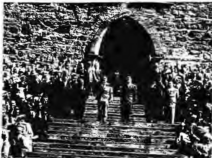
Tommy Hicks preaching on steps of a Lutheran cathedral in Turku. This is the seat of the Lutheran Theological Seminary. The Dean stands at right of microphone.

Thus it was that during the Fall of 1956 Evangelist Hicks returned to Finland for three-day, two-day and one-day campaigns in 10 different cities. Everywhere the Lutheran Churches